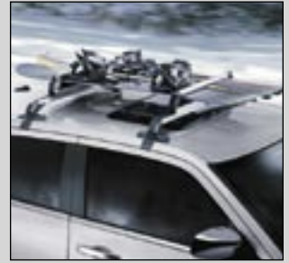
Six-Pair Ski and Snowboard Carrier