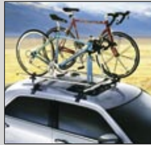
Roof-Mount Bike Carriers