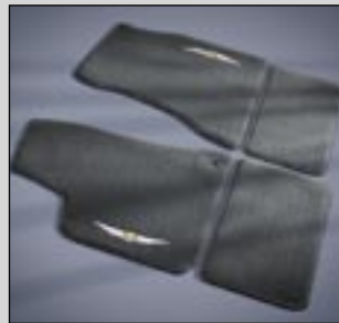
Premium Floor Mats