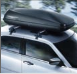
Roof Box Cargo Carrier and Removable Roof Rack