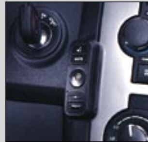
UConnect™ Hands-Free Communication